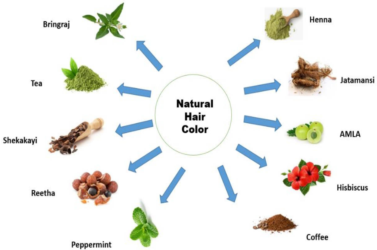
Figure 2. Components of natural hair color